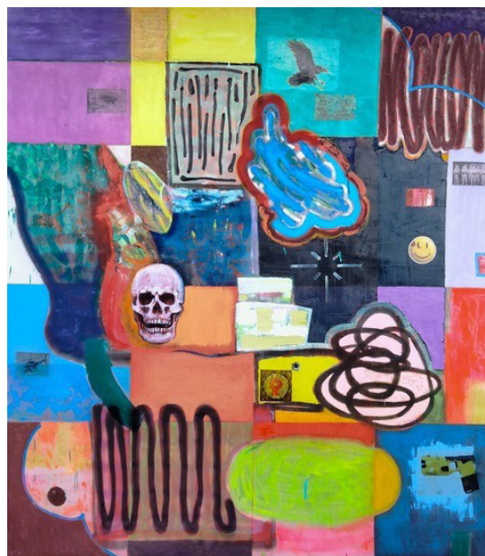
Max Presneill, Room 108, Protest Point. (Scope) , 2025 Oil, acrylic, spray paint, marker pen, photo-transfer, sticker on canvas 183 x 162.5cm

Vestry St. opened its doors in 2022 in Vestry Street, Hoxton in London in association with Cross Lane Projects. Visitors are invited into this uniquely intimate space to read, reflect, discuss, and view contemporary art in a salon-like setting. Located in a private residence on the road that bears its name, Vestry St. presents a programme of curated exhibitions and events by leading contemporary artists, both local and international.