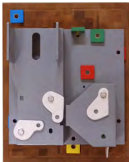
COMBINE (ARCHIGRAM V.1)