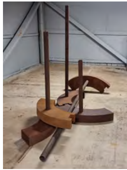
MIRROR BLOCKS / BENCH