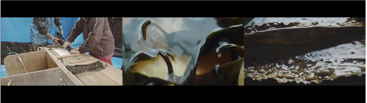
My Neighbour's Meal (2021) by Eiko Soga