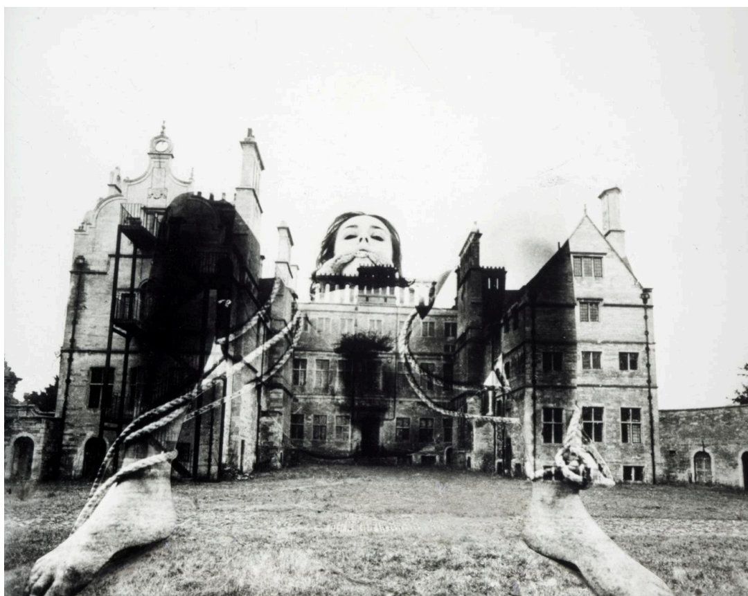
Penny Slinger, A Difficult Position , 1970-77. Copyright The Artist.

In-conversation with Hettie Judah: Friday, 5 July | 6pm