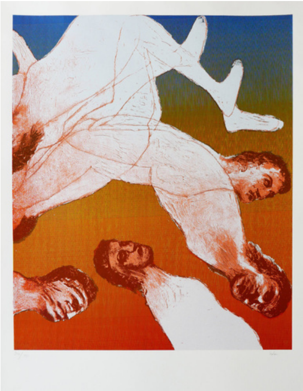
Sidney Nolan, Inferno VI , 1967, screenprint, 102 x 69 cm

A group exhibition of contemporary, and modern, works inspired by the life and writings of Dante Alighieri.