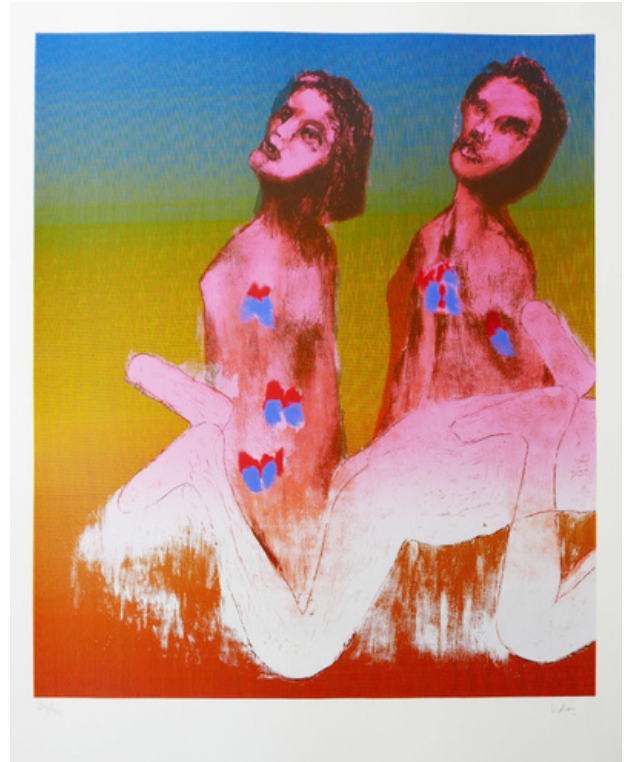
Sidney Nolan, Inferno VII , 1967, screenprint, 102 x 69 cm

Few writers have had such a profound influence upon Western visual culture as Dante Alighieri. His great poem, The Divine Comedy (as it is now known), has inspired artists almost since the time of its completion in 1320: from Giovanni di Paolo and Sandro Botticelli, through William Blake and Dante Gabriel Rossetti, to Robert Rauschenberg and Sidney Nolan. And it continues to inspire artists to this day.