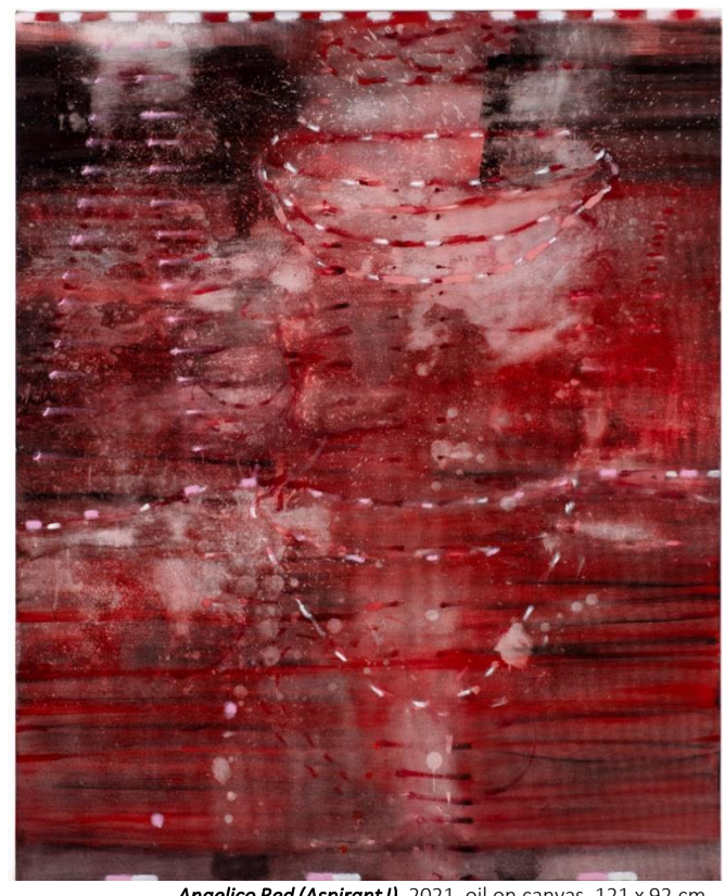
Angelico Red (Aspirant I), 2021, oil on canvas, 121 x 92 cm