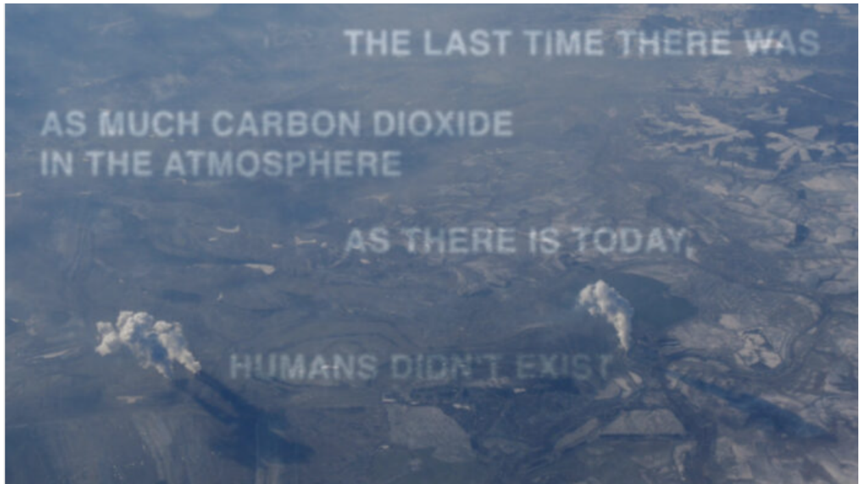
Oliver Ressler , The last time there was as much carbon dioxide in the atmosphere as there is today, humans didn't exist , digital print, 2020.

A public programme will accompany the exhibition, connecting with key London-based voices including those active in the climate movement; as well as with activist networks contributing to public demonstrations in the city over the duration of the exhibition, and with local constituents in The Showroom neighbourhood. Full details to be announced.