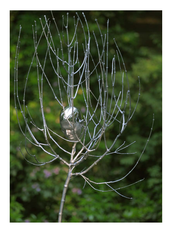
Rona Pondick, Head in Tree (detail), 2006–08. Stainless steel. 266.7 x 106.88 x 93.98 cm (105 x 42.08 x 37 in). Installation view of Sonsbeek, 2008. © Rona Pondick

In the four decades of her artistic career, Pondick has worked across a wide variety of traditional and nontraditional materials, and her use of stainless steel has been particularly pivotal in steering the direction of her sculptural practice. First employed in the late 1990s when she created her earliest animal-human hybrids, the reflective material is intimately connected to her deep interest in states of metamorphosis, allowing her to experiment with surface texture – 'it looks as if it's disintegrating in front of you, as if it were in flux.' Viewers' bodies are captured, distorted and mirrored as reflections upon the shiny surfaces of the steel sculptures, integrating their image into the tangle of human, plant and animal forms.