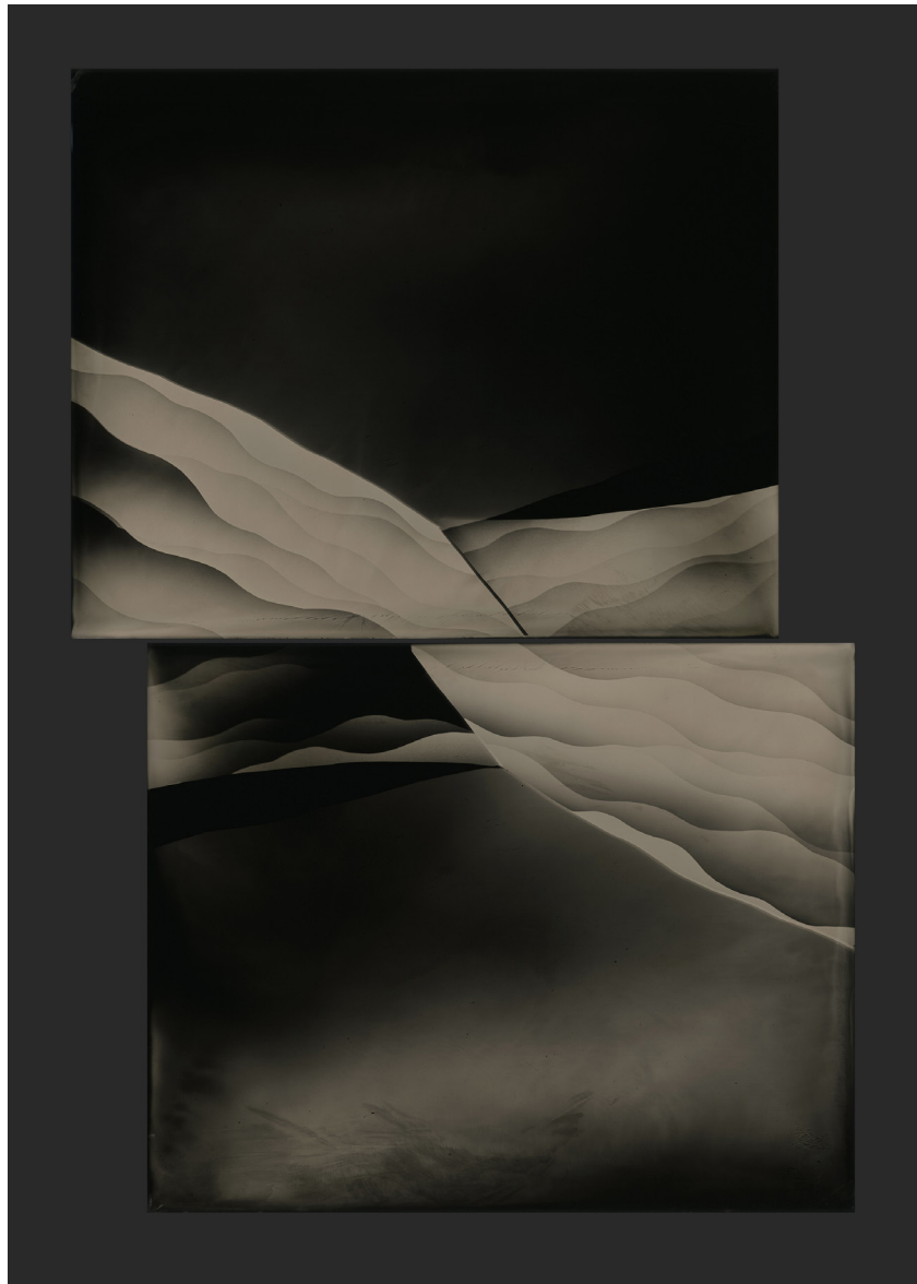
Immanent Forms, Waves: Transposition, 2023