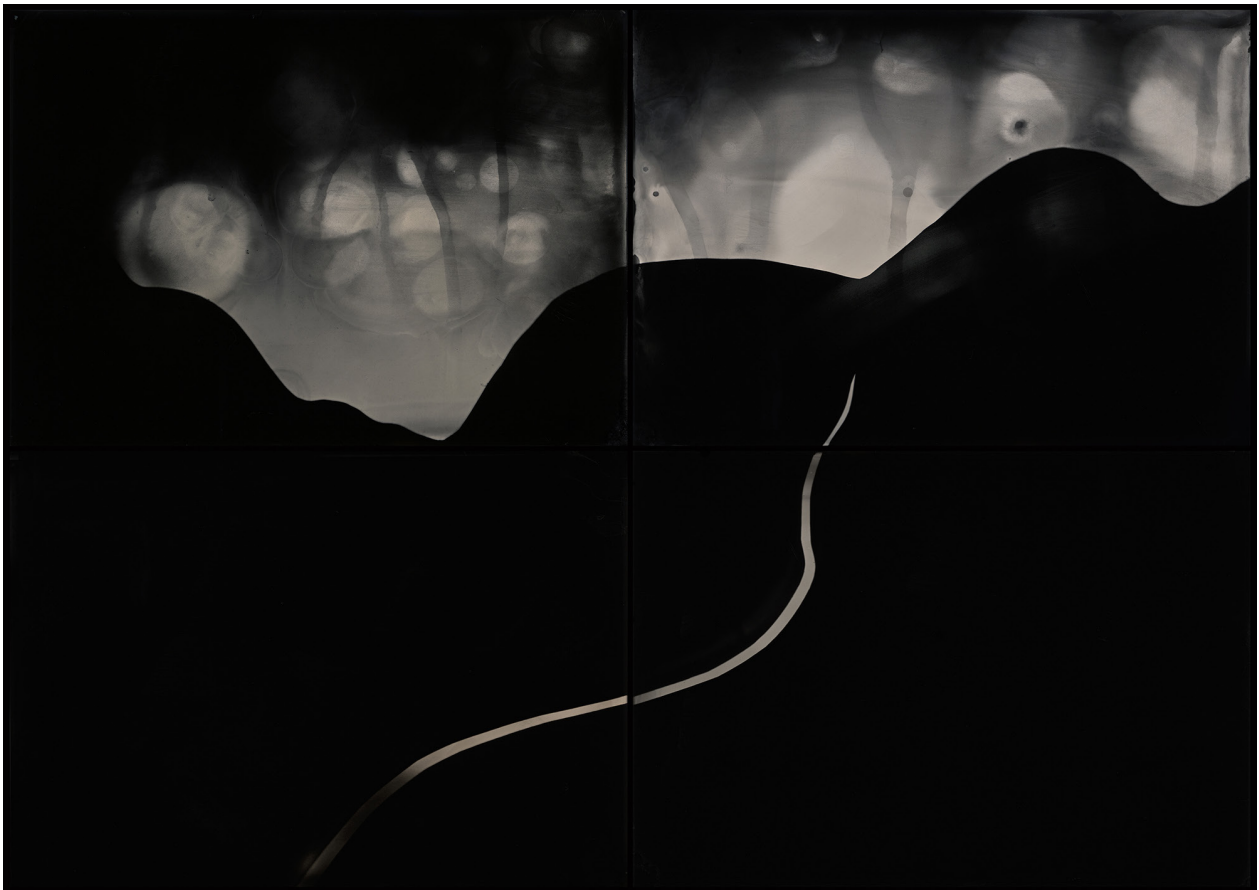
Elemental Forms, Landscape no. 30, 2018