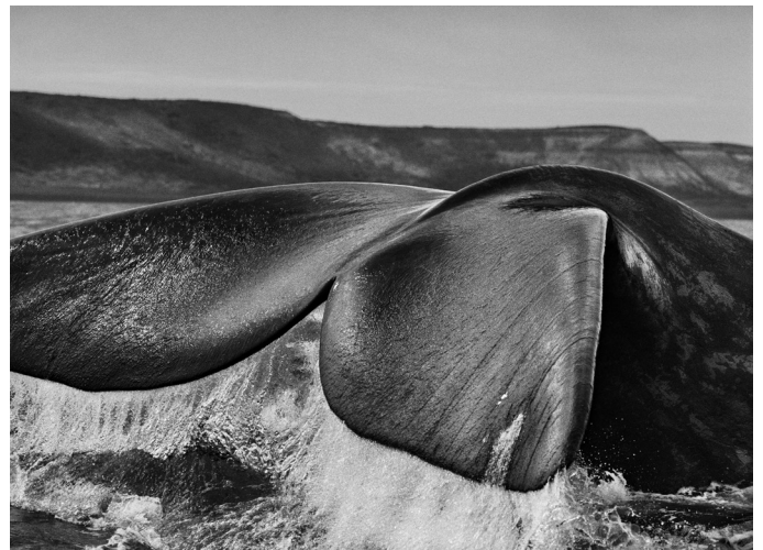
Clockwise from top left: Korem Camp , Ethiopia, 1984, platinum-palladium print, 56 x 76 cm, Serra Pelada , State of Pará, Brazil, 1986, platinum-palladium print, 76 x 112cm, Yanomami Indigenous Territory , State of Amazonas, Brazil, 2014, platinum-palladium print, 76 x 112cm, Valdes Peninsula , Argentina, 2004, platinum-palladium print, 56 x 76 cm