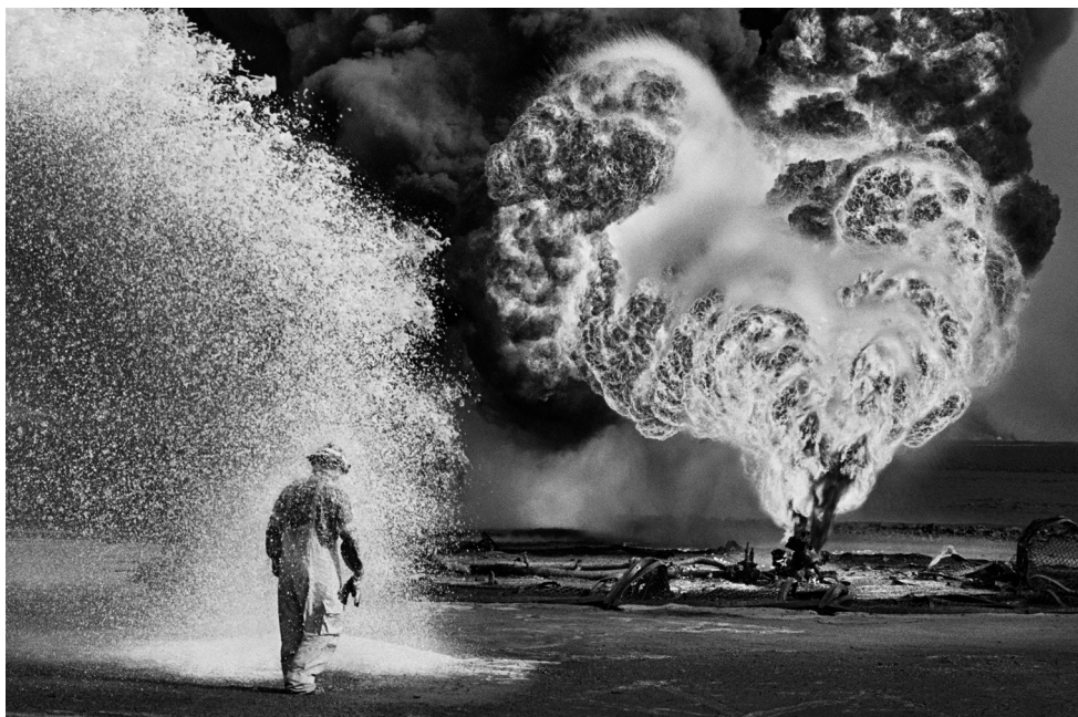
Greater Burhan Oil Field, Kuwait, 1991, platinum-palladium print, 90 x 120 cm

Flowers Gallery is pleased to announce a solo exhibition by Sebastião Salgado, presenting selected works from his new series of platinum-palladium prints. The photographs in Magnum Opus are representative of some of Salgado's major works, representing almost five decades of photographic expeditions around the world.