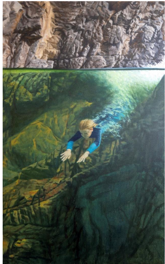
Deep Pool 1 , oil on canvas, 214 x 132 cm

A wild swimmer, diminutive against a brooding mountainside, a fell farmer bottle-feeding a calf, memory traces of mine tracks and old stone walls through moor and mire... The large canvases of Julian Cooper that comprise this Lines of Descent exhibition are both visually arresting and psychologically unsettling. The Lake District's pre-eminent painter, Cooper challenges our perceptions of Britain's uplands, a landscape contingent on forces of not only raw nature but those of economics and public prejudices.