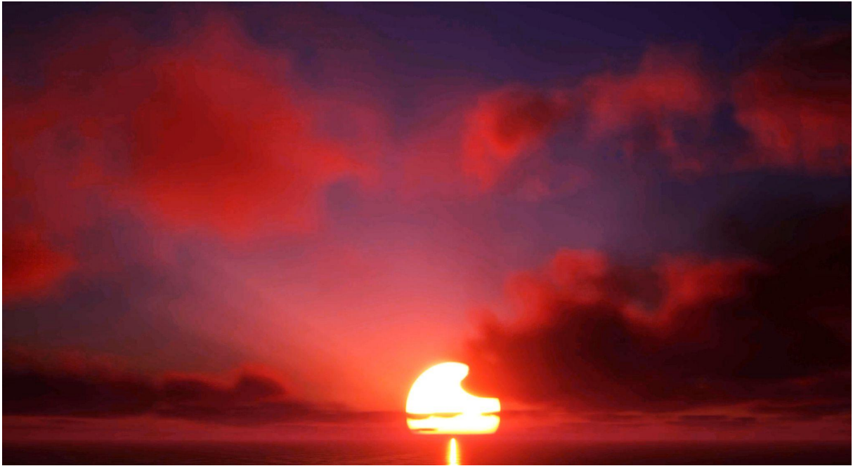
Above: Still images of Jinjoon Lee's Wandering Sun , 2022.

Finally, Jinjoon Lee 's series Wandering Sun continues the artist's exploration of liminal spaces and further questions the relationship between natural and artificial through AI-generated sceneries. For Lee, the piece expresses the need to reconnect with time and space in an increasingly virtual world;