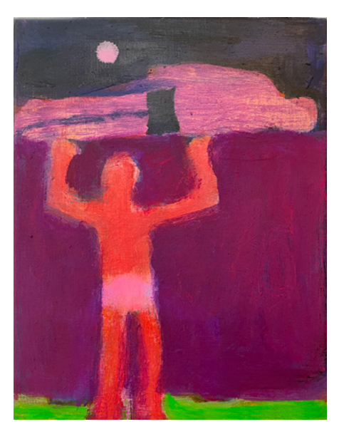
Katherine Bradford: Man Lifting Man (2022) Acrylic on canvas 35 x 28 cm