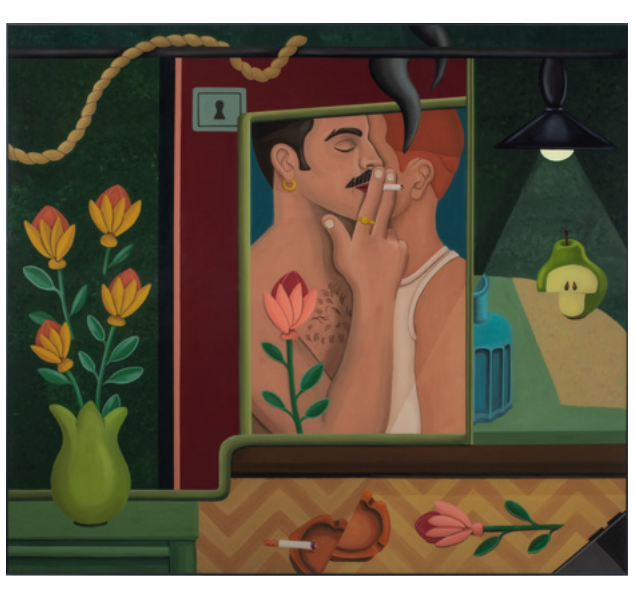
Gori Mora: Study of a living room (2022) Oil on perspex 145 x 160 cm