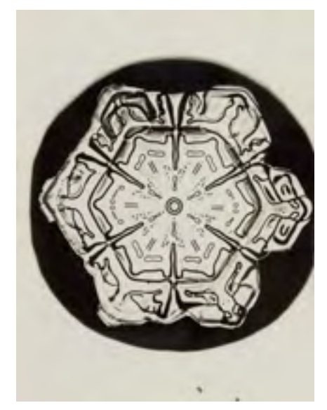
Wilson Bentley untitled (c 1900 – 1920) vintage microphotograph 10.2 x 7.6 cm / 4 x 3"