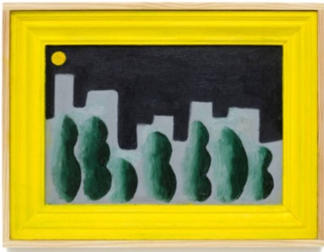
New Town oil on shaped wood, 2020 30 x 23 x 3cm