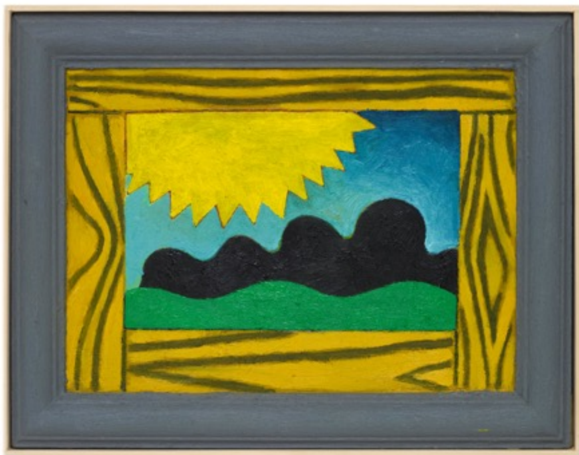
The Shadow Oil on shaped wood, 2020 36 x 28 x 3 cm