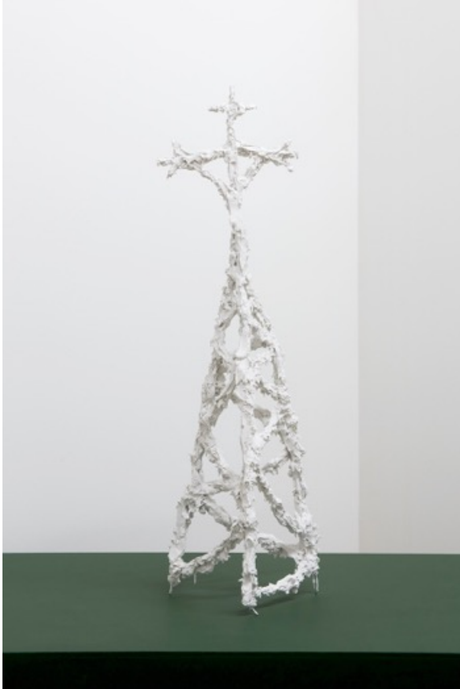
Pylon (Lord) 80 x 25 x 17 cm