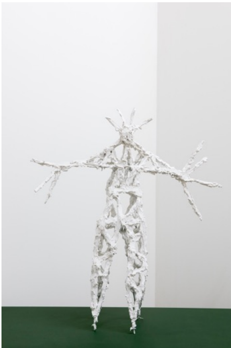
Pylon (King) 78 x 69 x 22 cm