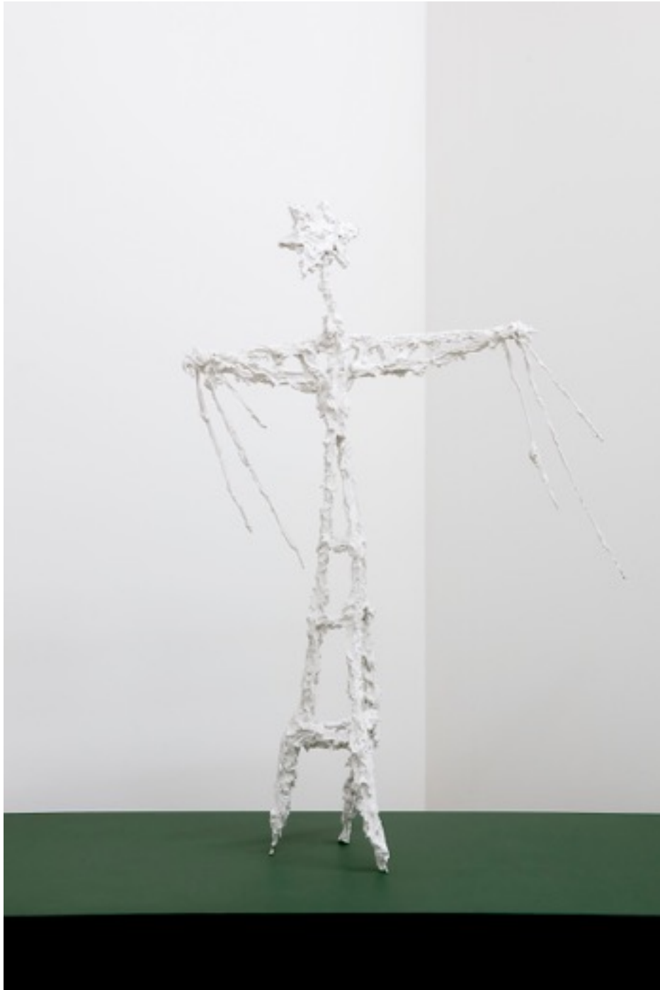
Pylon (Reaper) 100 x 60 x 26 cm