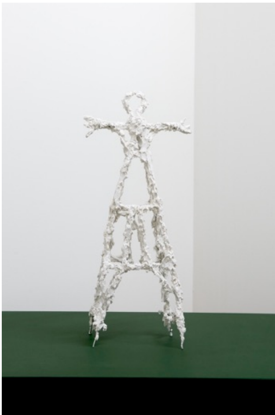
Pylon (Scout) 59 x 26 x 14 cm