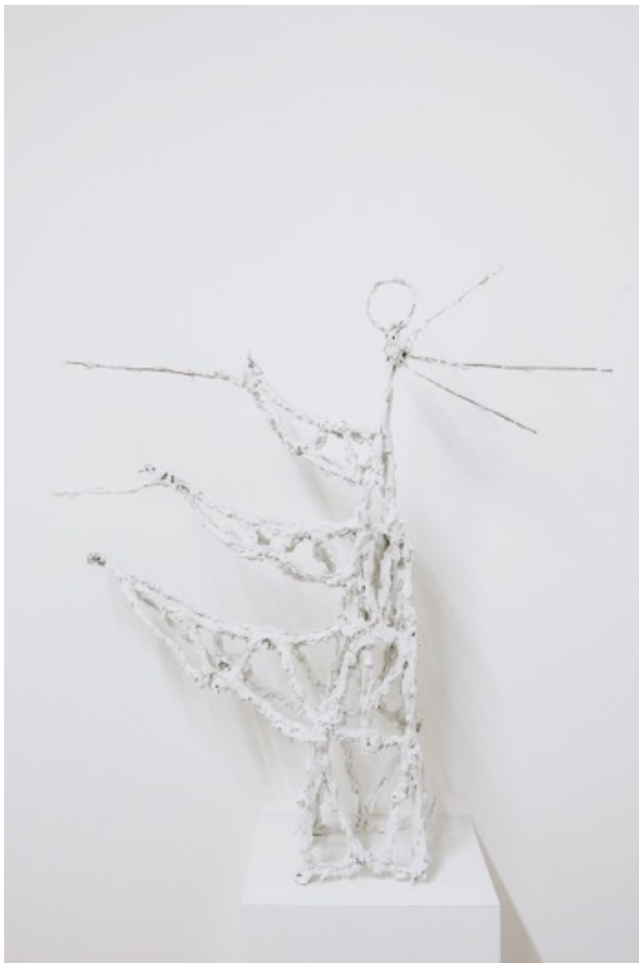
Pylon (Angel) 75 x 74 x 21 cm