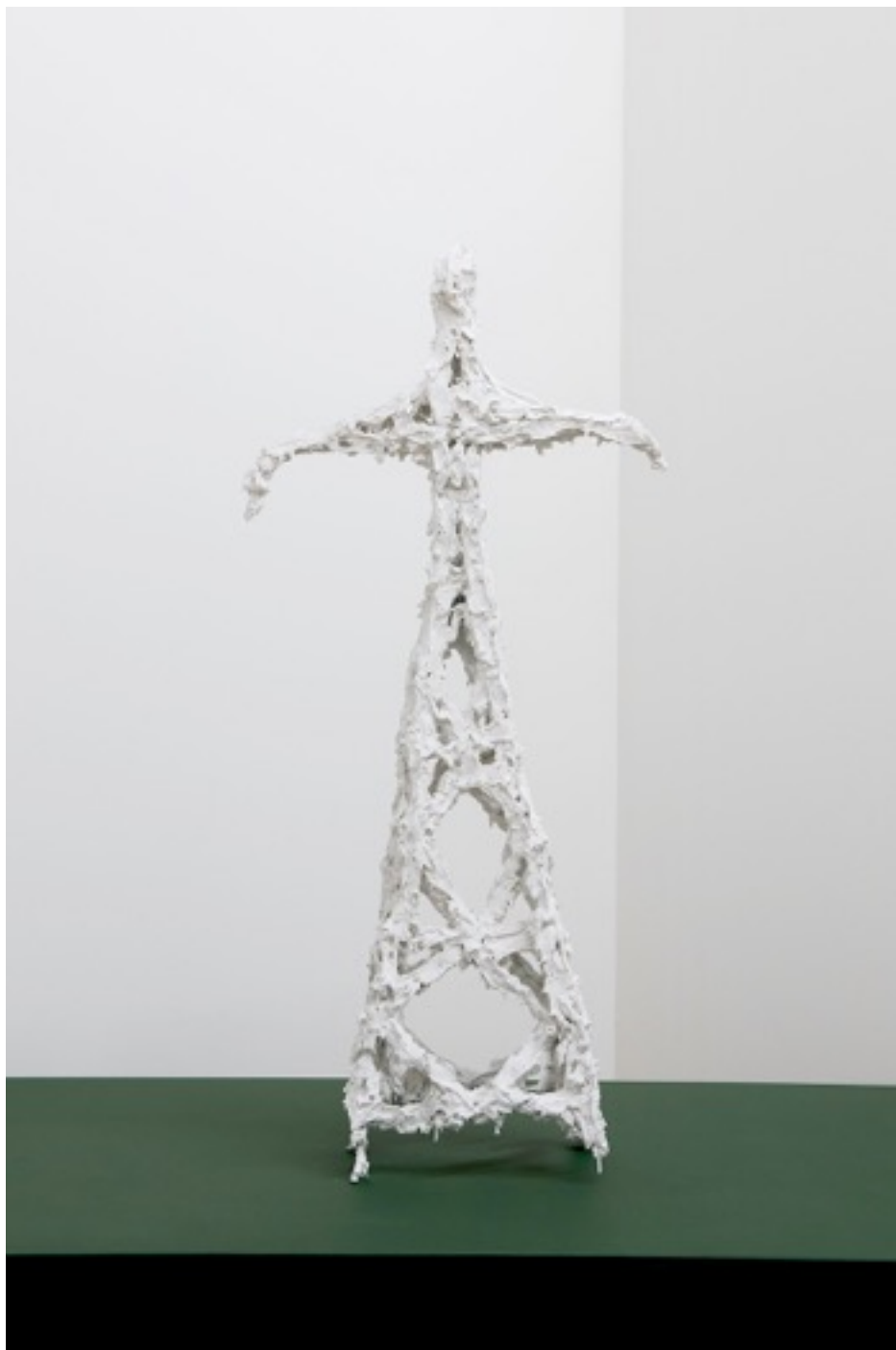
Pylon (Serf) 80 x 37 x 13 cm