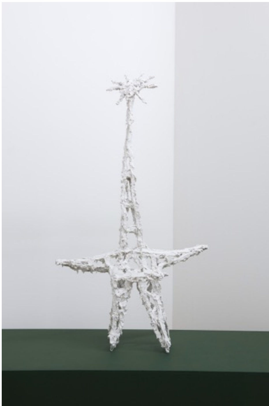
Pylon (The Speaker) 110 x 60 x 13 cm