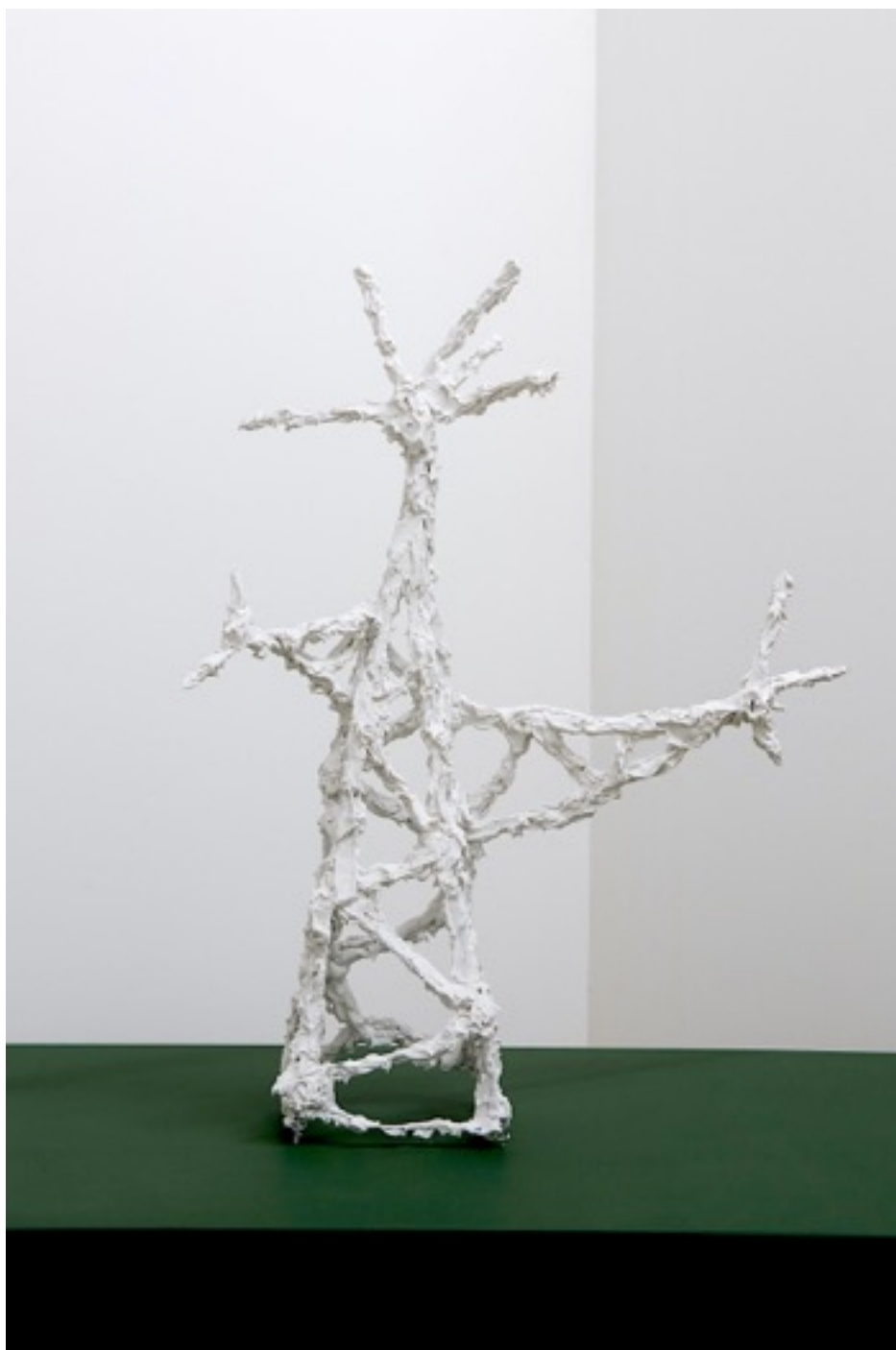
Pylon (Catcher) 73 x 57 x 23 cm