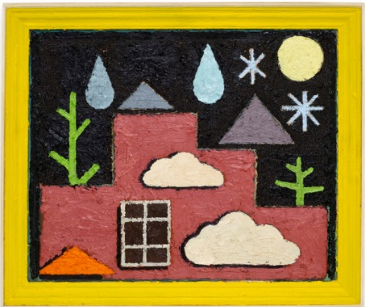
Citadel Oil on shaped wood, 2020 53 x 46 x 3cm