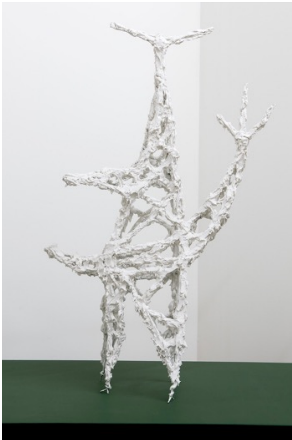
Pylon (Butcher) 52 x 88 x 21 cm