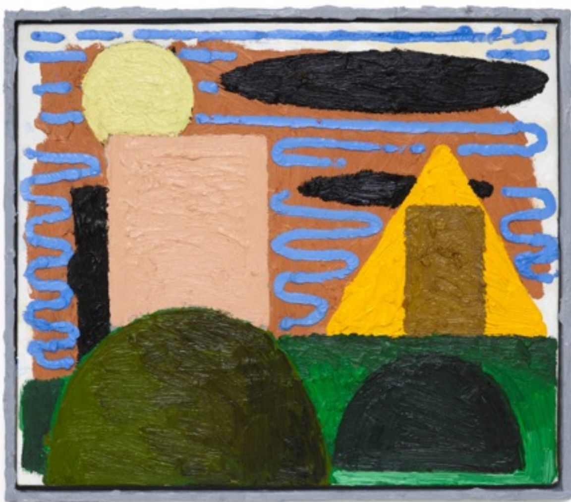
Conspiracy Shapes Oil on canvas & wood, 2020 42 x 37 x 3cm