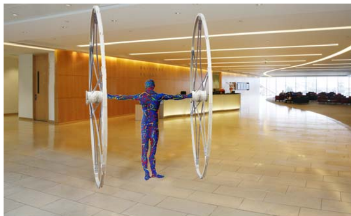
Proposal for Clifford Chance