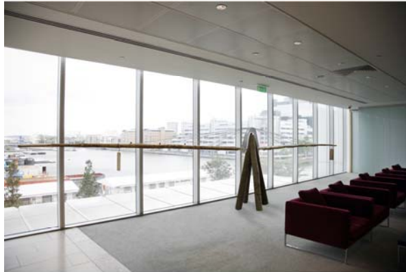
Proposal for Clifford Chance