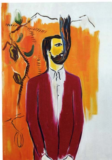
René Daniëls. Cocoanuts , 1982. Oil on canvas, 200 x 240 cm. © the artist / Courtesy Jan Maarten Boll

Camden Arts Centre is delighted to present a new exhibition of paintings and drawings by Dutch artist René Daniëls, spanning works from 1981 to 1987. Following the inclusion of three paintings in Archipeinture: painters build architecture , a group exhibition at Camden Arts Centre in 2006, the interest in Daniëls work has become apparent amongst contemporary artists and is the primary catalyst for bringing together this larger body of works.