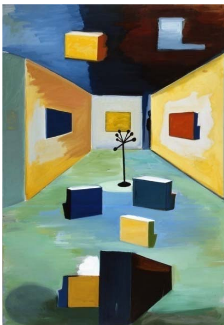
René Daniëls. De terugkeer van de performance (The Return of the Performance), 1987. Oil on canvas, 190 x 130 cm. © the artist / Courtesy of Paul Andriessse