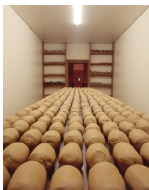
Installation view 'Among Many' (retrospective exhibition), 2005. Pinacoteca do Estado de Sao Paulo, Brazil.