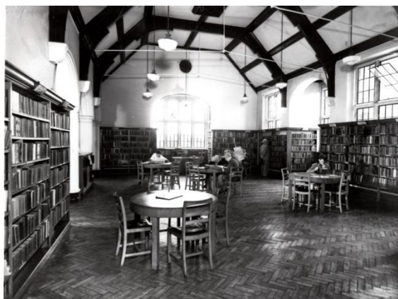
Hampstead Central Library, Reference Room (now Gallery 3), 1950s*