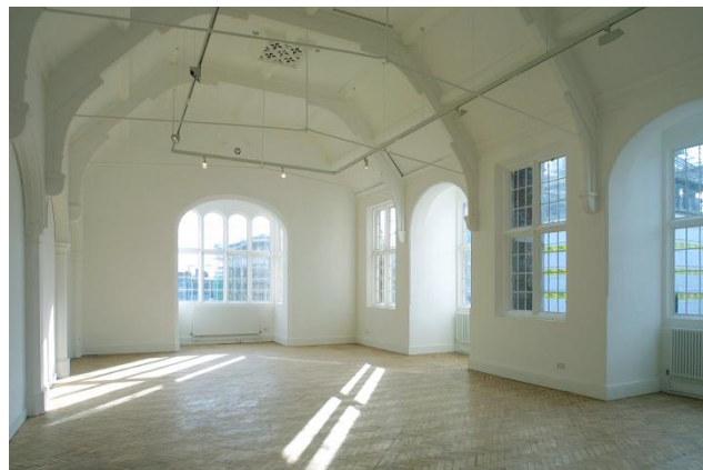
Camden Arts Centre, Gallery 3, 2010

Camden Arts Centre is delighted to present a new exhibition curated by British artist Simon Starling, the latest in a series of artist-selected shows.